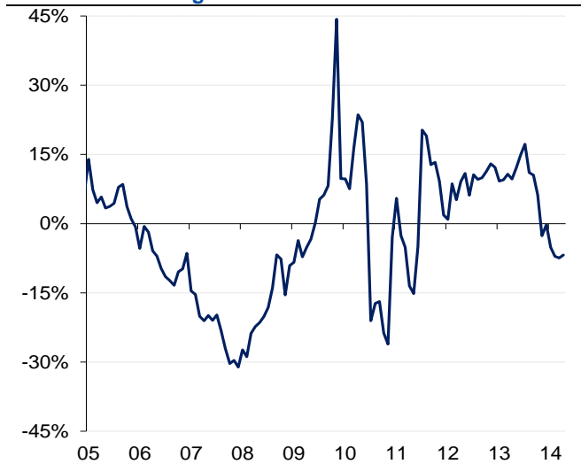
Graph 1 Existing Home Sales SAAR YoY% Change

Source: US Census Bureau & BBVA Research