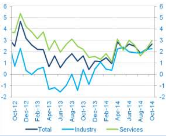
Figure 1 IGAE and its components (YoY %, sa)

sa = seasonally adjusted.