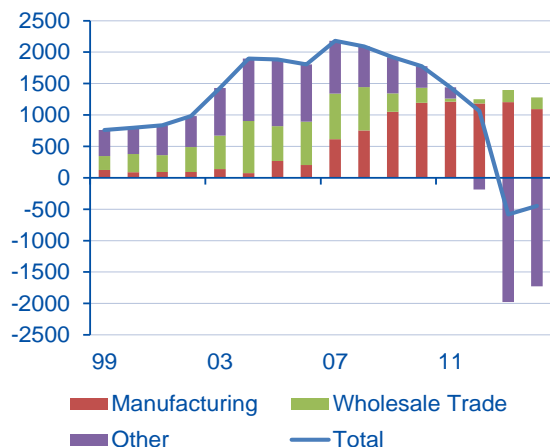
Chart 1 U.S. Direct Investment in Greece ($Mn)

There are obviously some serious consequences for Greece and the rest of the Eurozone, but how does this impact the U.S.?