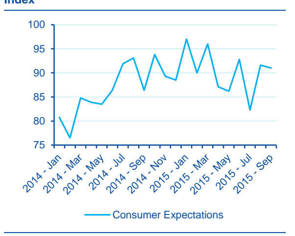
Chart 1 Consumer Expectations Index