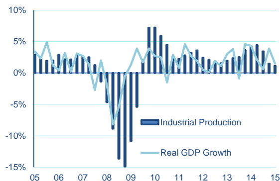
Chart 1 Industrial Production Index (YoY % Change)

October's decline in industrial production continues to show the effect low oil prices are having on the energy sector as it continues to shrink rapidly. However, the broad-based uptick in manufacturing output points to the slackening of the inventory headwinds that weighed on real GDP growth in the third quarter. Combined with October's CPI report that indicated some inflationary pressures and the month's encouraging employment report of a tightening labor market, this industrial production report reaffirms our expectations for a stronger 4Q to close out the year.