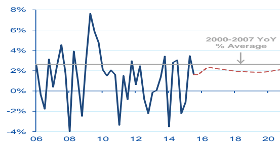
Chart 2 Productivity Forecasts (QoQ SAAR % Change)