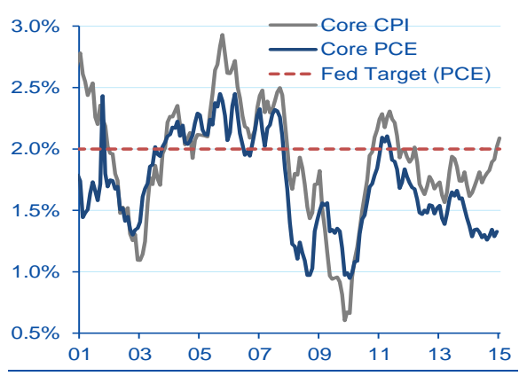
Chart 1 Inflation Metrics (YoY % Change)

On a YoY level, core CPI experienced its largest gain since July 2012, rising 2.1%. However, the Fed's preferred inflation metric, the core PCE index, was up only 1.3% YoY in November—remaining below the Fed's 2% YoY target. Given continued declines in oil prices and December's soft CPI readings, it could be harder for inflation to edge closer to the Fed's target in upcoming months.