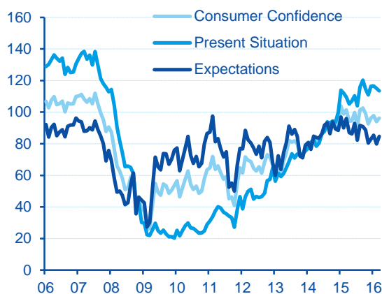
Chart 1 Consumer Confidence Index, SA, 1985=100