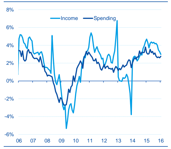
Chart 1 Real Personal Income and Spending YoY % Change