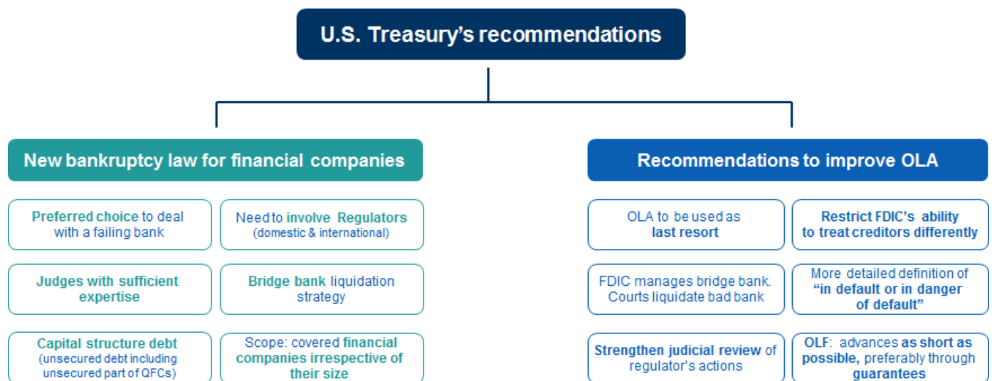
Figure 1.1 U.S. Treasury’s main recommendations