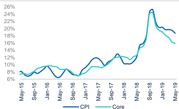
Chart 2. HEADLINE (CPI) & CORE INFLATION