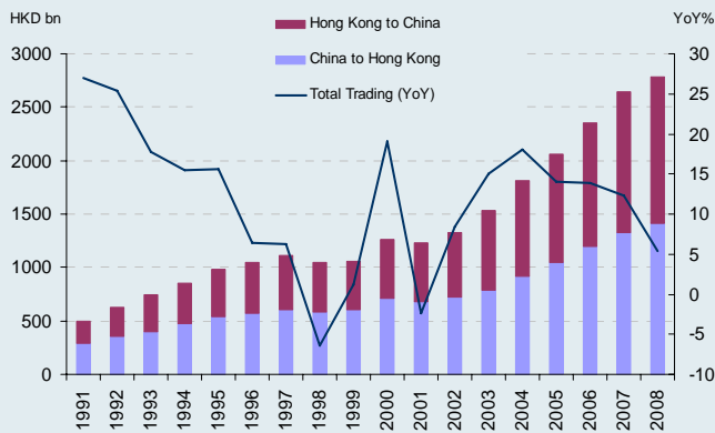
Chart 2: Mainland China Total Trade with Hong Kong

Under this pilot scheme, Hong Kong should benefit most for its gigantic trading volume with Mainland (namely HKD 2,783 billion in 2008) which is concentrated in Guangdong and Shanghai –two of the authorized areas- with 80% of total trade (Chart 2&3).