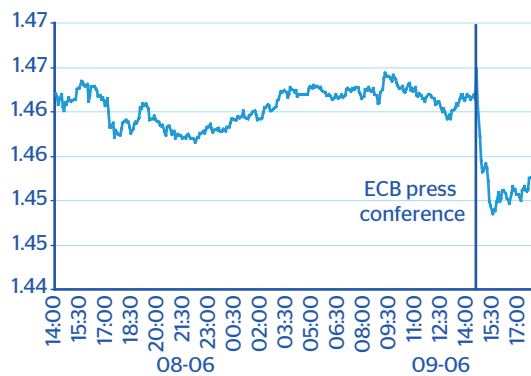
Euro-Dollar: intraday change (ER each 5 minutes)