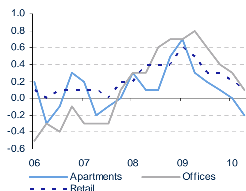
Chart 2 Vacancy Rates (Quarterly Variation)